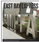
Jan 27, 2016