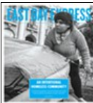
Feb 10, 2016