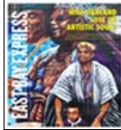
Feb 17, 2016