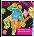
Mar 2, 2016