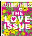
Feb 3, 2016